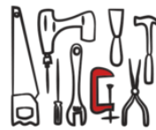
PHASE 4: RESTORATION