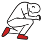
PHASE 2: CONFESSION